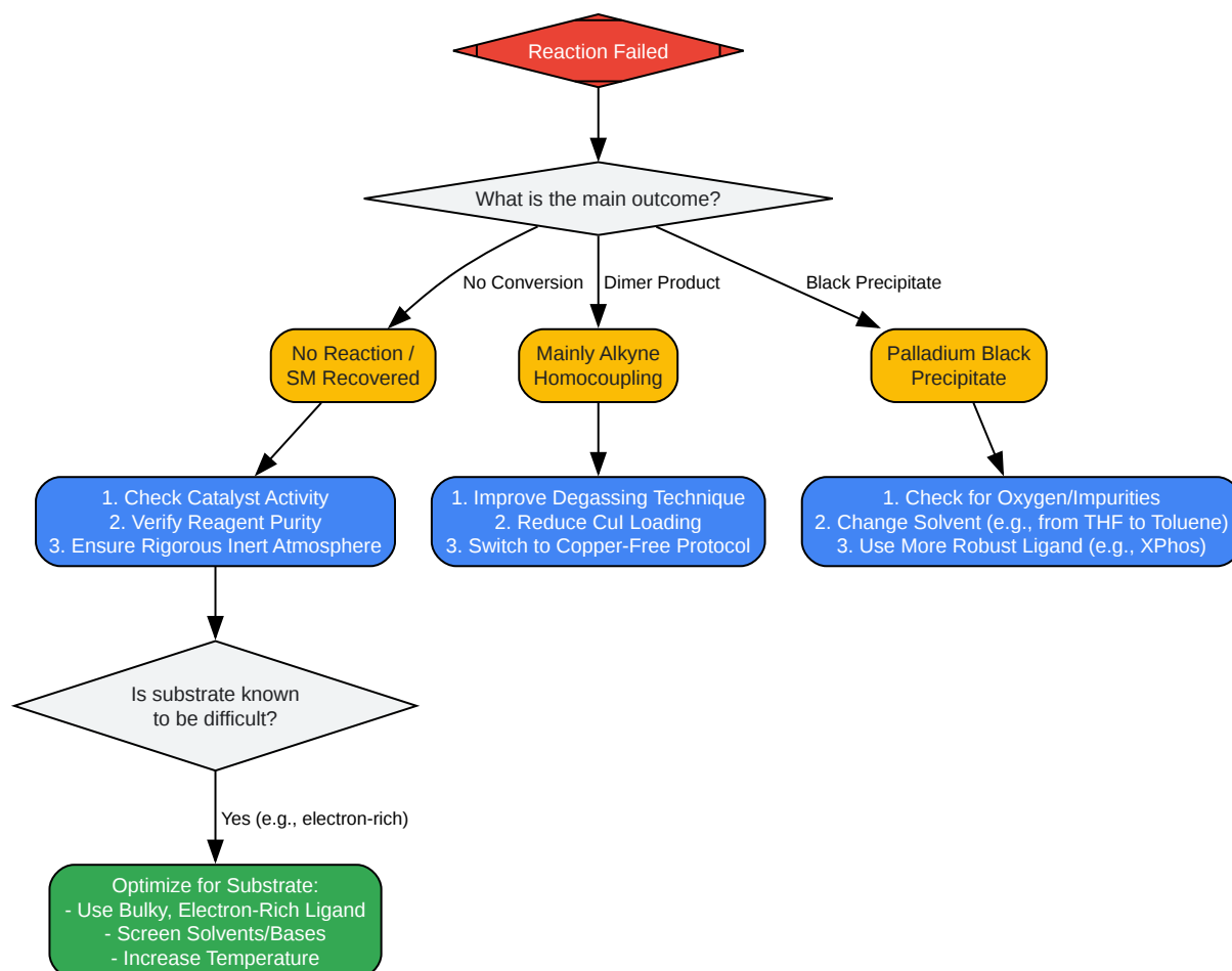
Fig. 2: Troubleshooting Failed Couplings

Click to download full resolution via product page