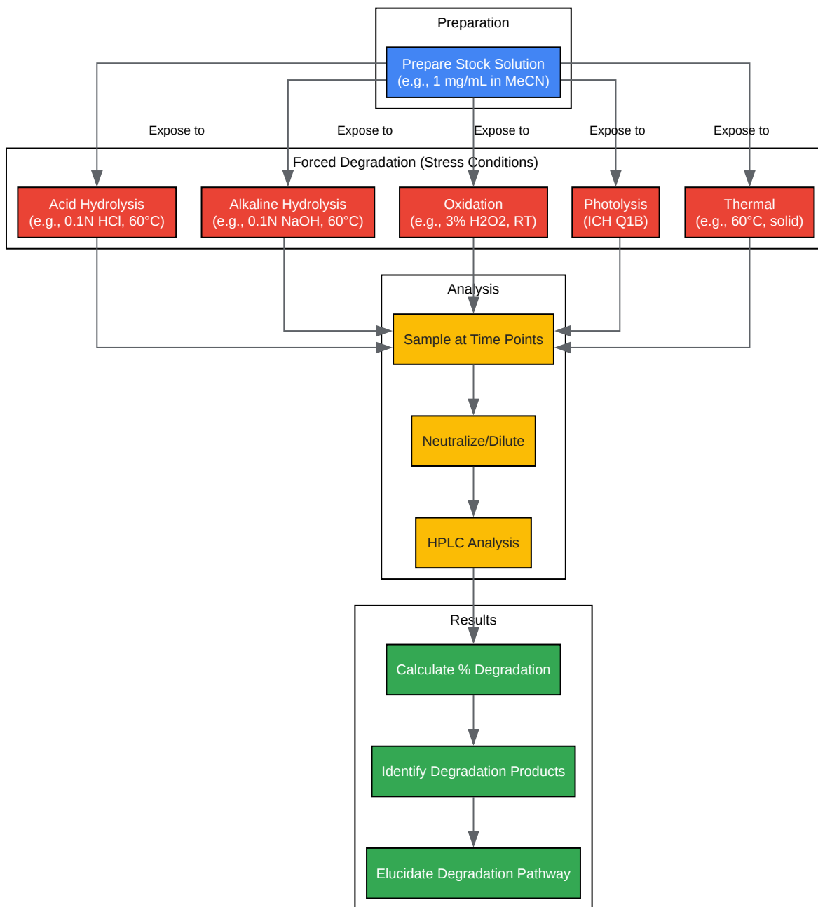
General Workflow for Stability Testing of 4-Bromoquinolin-7-ol