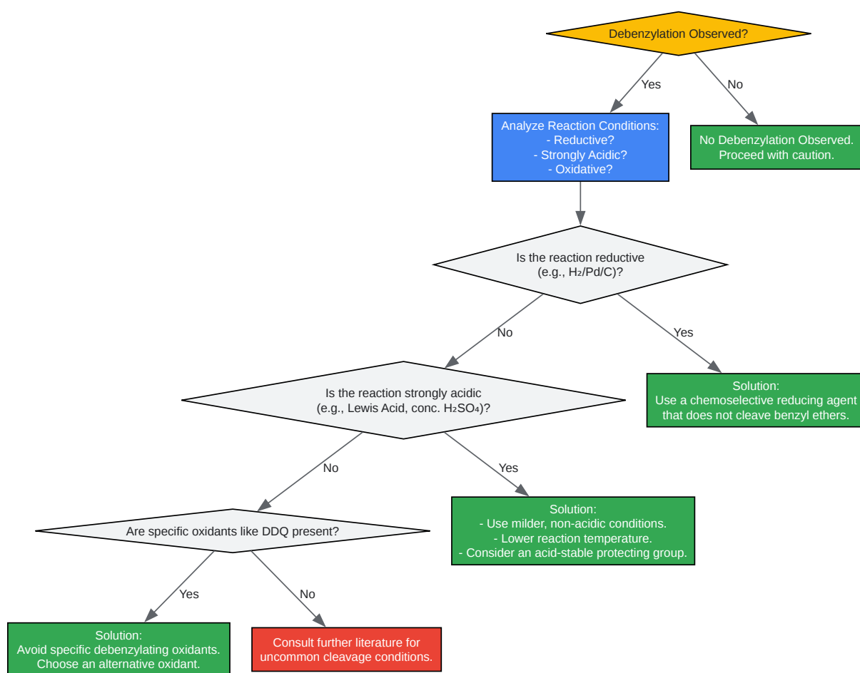
Figure 2: Troubleshooting Workflow for Unexpected Debenzylation

Click to download full resolution via product page