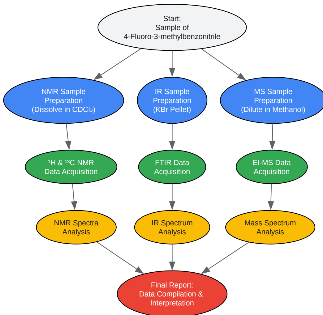
Diagram 2: Experimental Workflow

Click to download full resolution via product page