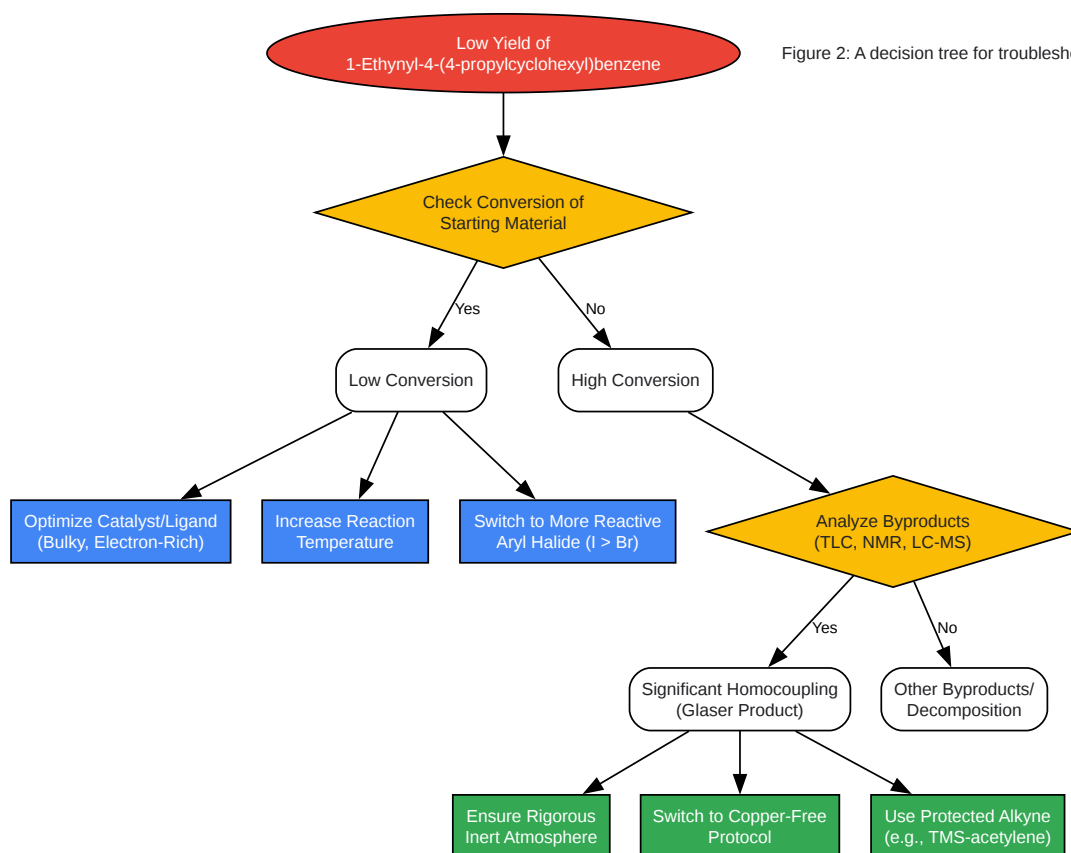
Figure 2: A decision tree for troubleshooting low yields.

Click to download full resolution via product page