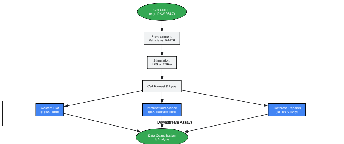
Figure 3. General Experimental Workflow

Click to download full resolution via product page