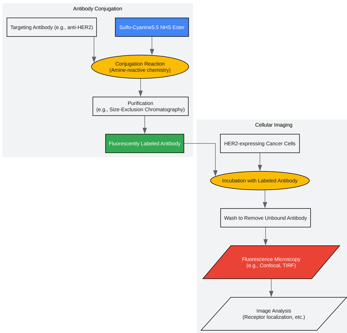
Antibody Conjugation and Cell Imaging Workflow

Click to download full resolution via product page