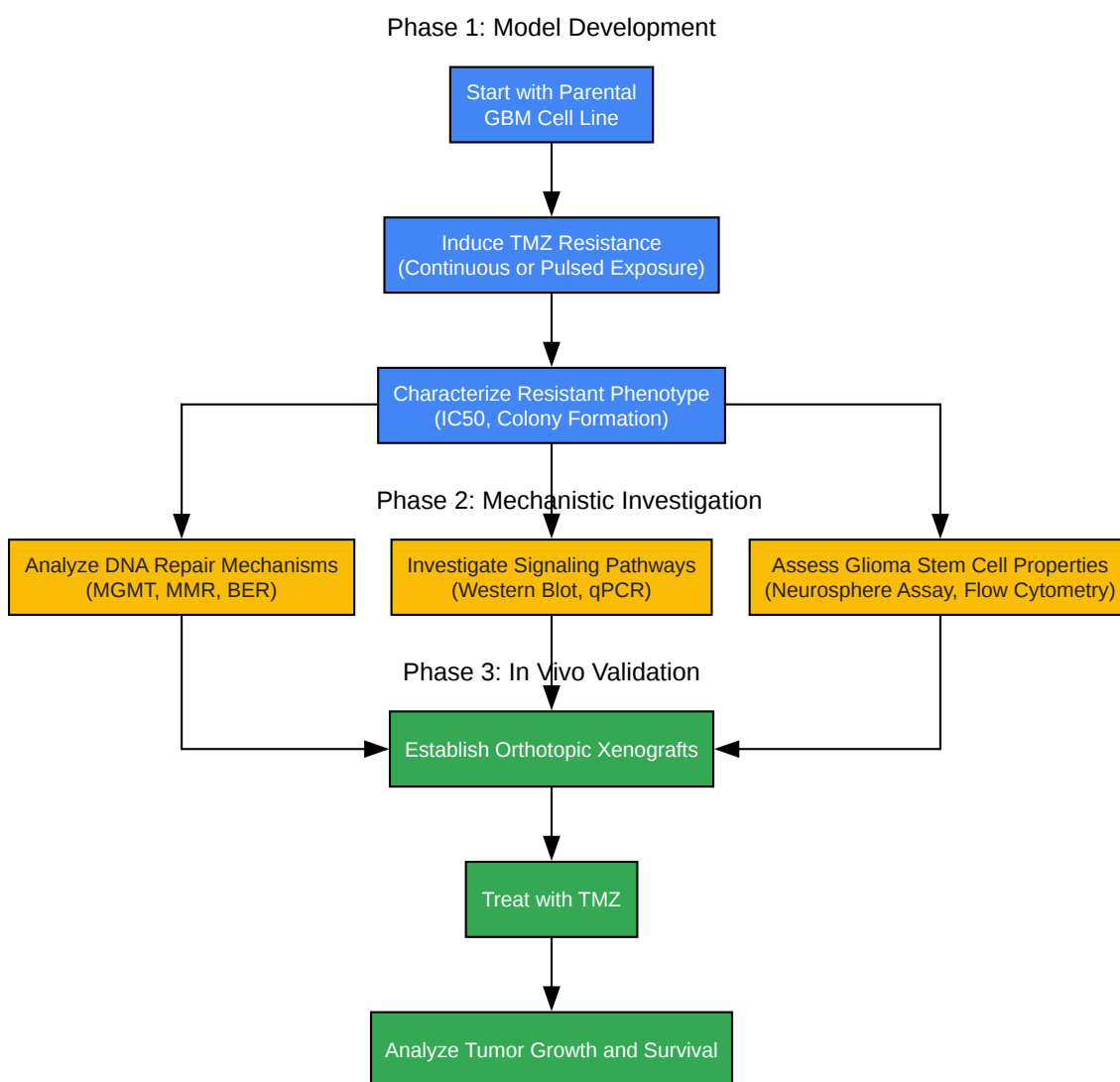
Experimental Workflow for Studying TMZ Resistance

A systematic approach is essential for studying TMZ resistance. The following workflow outlines the key experimental stages.