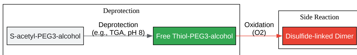
Diagram 1: S-acetyl Deprotection and Subsequent Thiol Oxidation

Click to download full resolution via product page