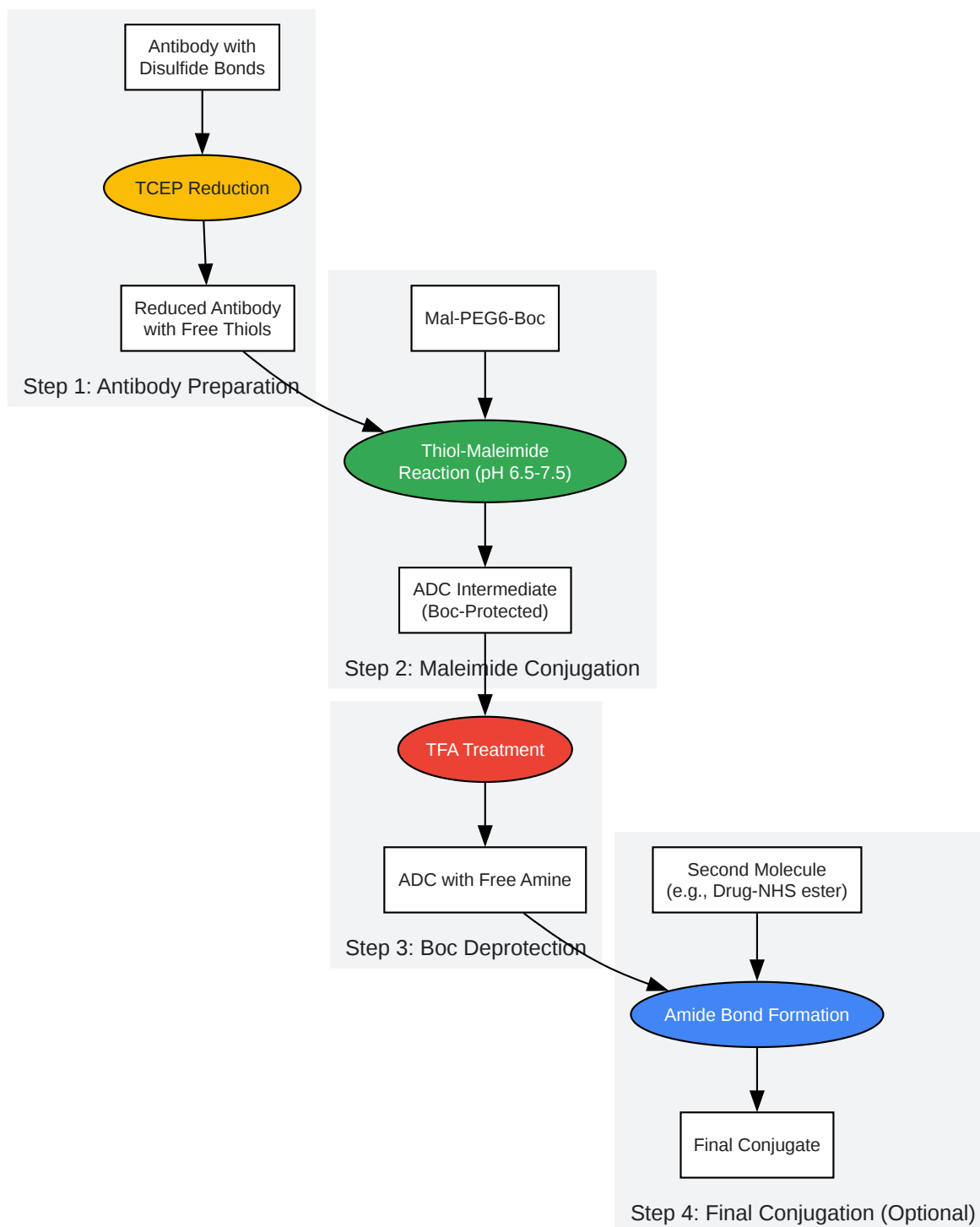
Figure 1: General Workflow for Mal-PEG6-Boc Mediated Bioconjugation

Click to download full resolution via product page