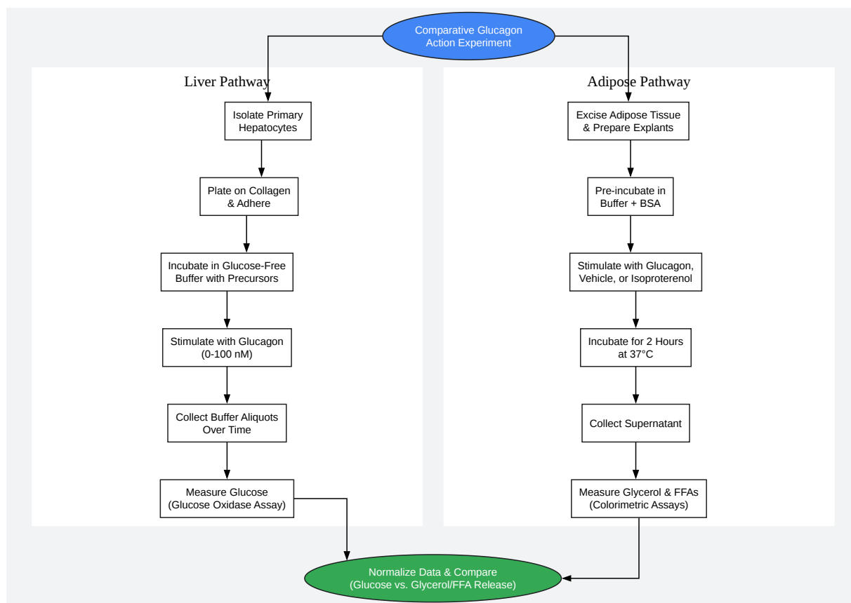
Diagram of Experimental Workflow

Click to download full resolution via product page