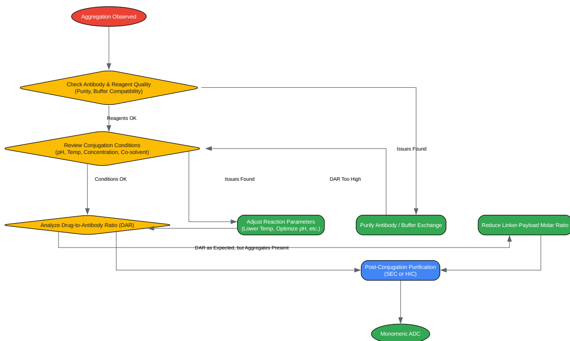
Troubleshooting Aggregation During Antibody Conjugation

Click to download full resolution via product page