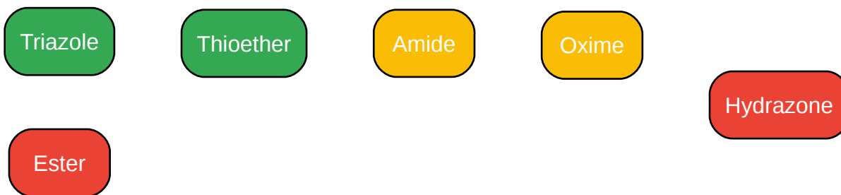
Figure 2. Experimental Workflow for Linker Stability Assessment.

Click to download full resolution via product page