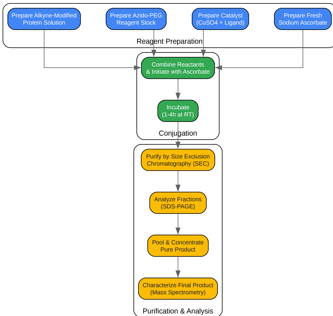
Figure 1. Experimental Workflow for Protein PEGylation

Click to download full resolution via product page