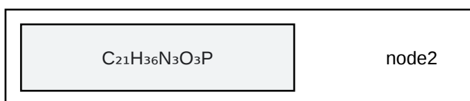
Chemical Structure of Alkyne Phosphoramidite, 5'-terminal

Click to download full resolution via product page