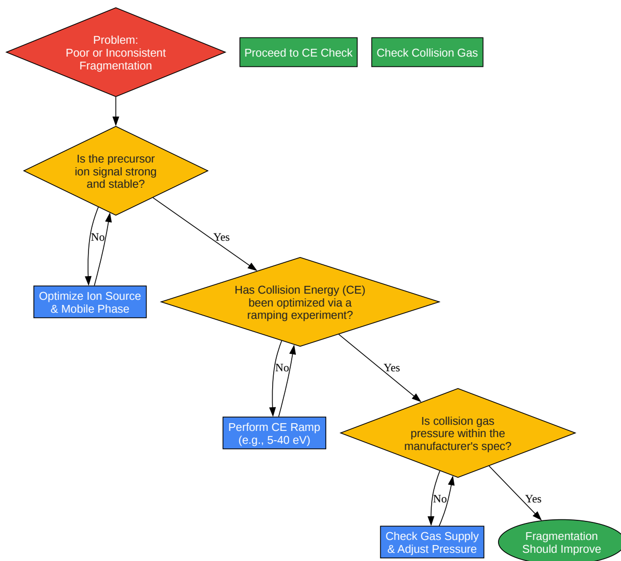
Diagram 2: Troubleshooting Logic for Poor Fragmentation

Click to download full resolution via product page