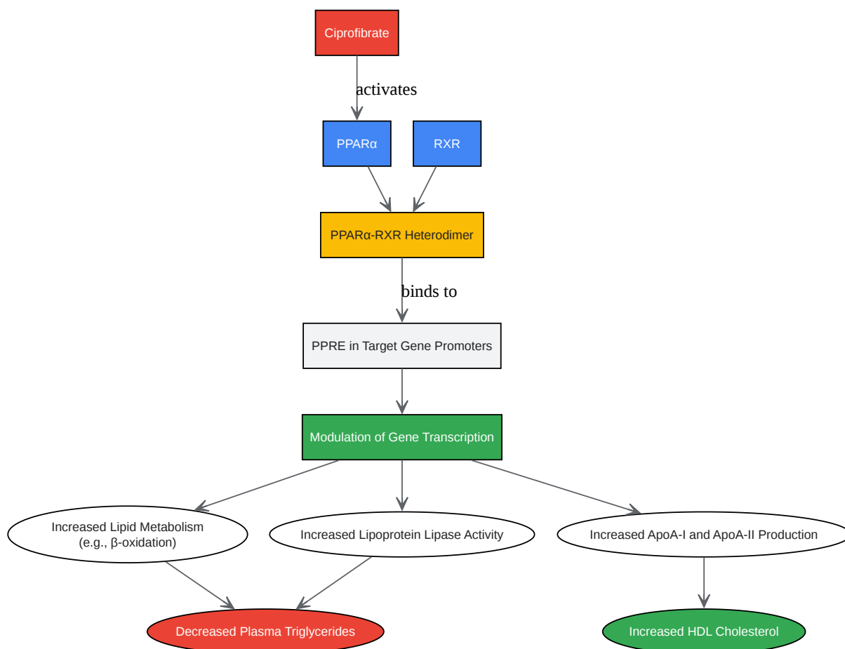
Figure 2: Ciprofibrate Signaling Pathway

Click to download full resolution via product page