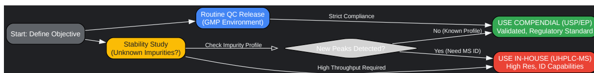
Diagram 2: Analytical Decision Matrix

Click to download full resolution via product page