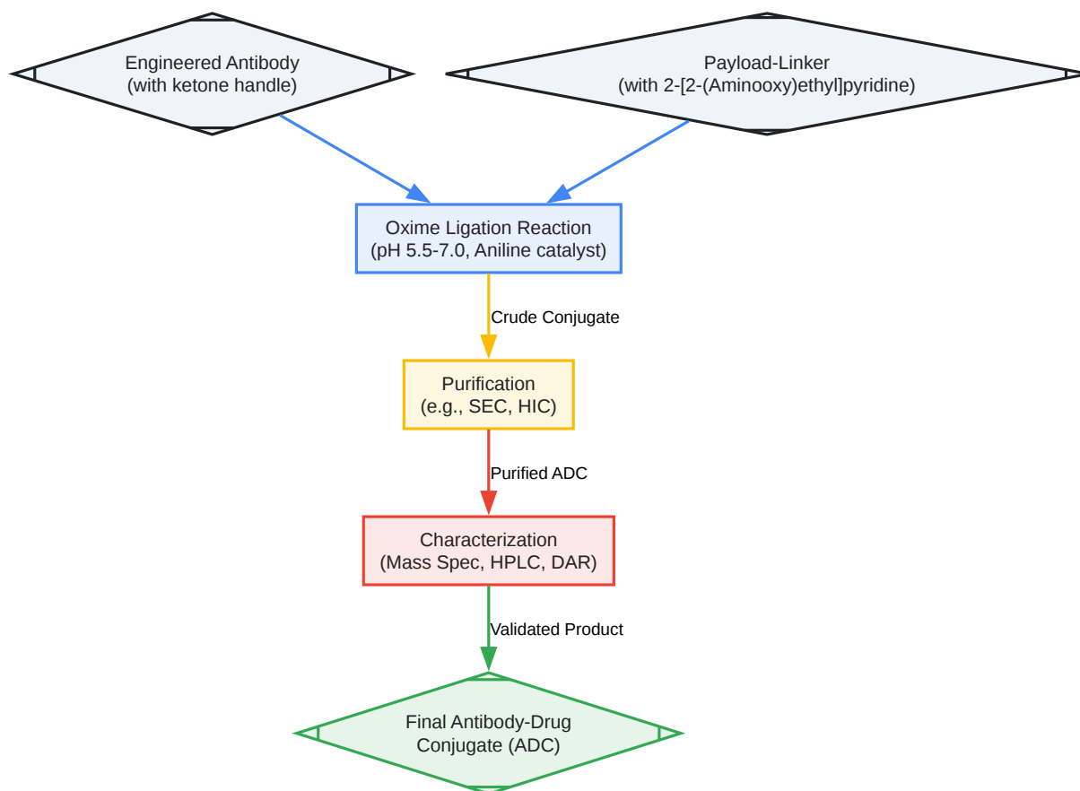
Figure 2: General Workflow for ADC Synthesis via Oxime Ligation

Click to download full resolution via product page