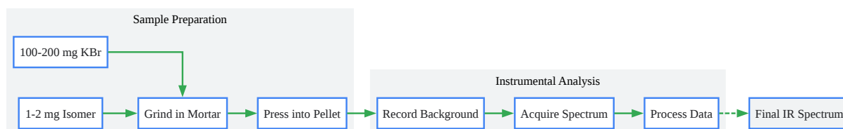
Diagram of IR Spectroscopy Workflow

Click to download full resolution via product page