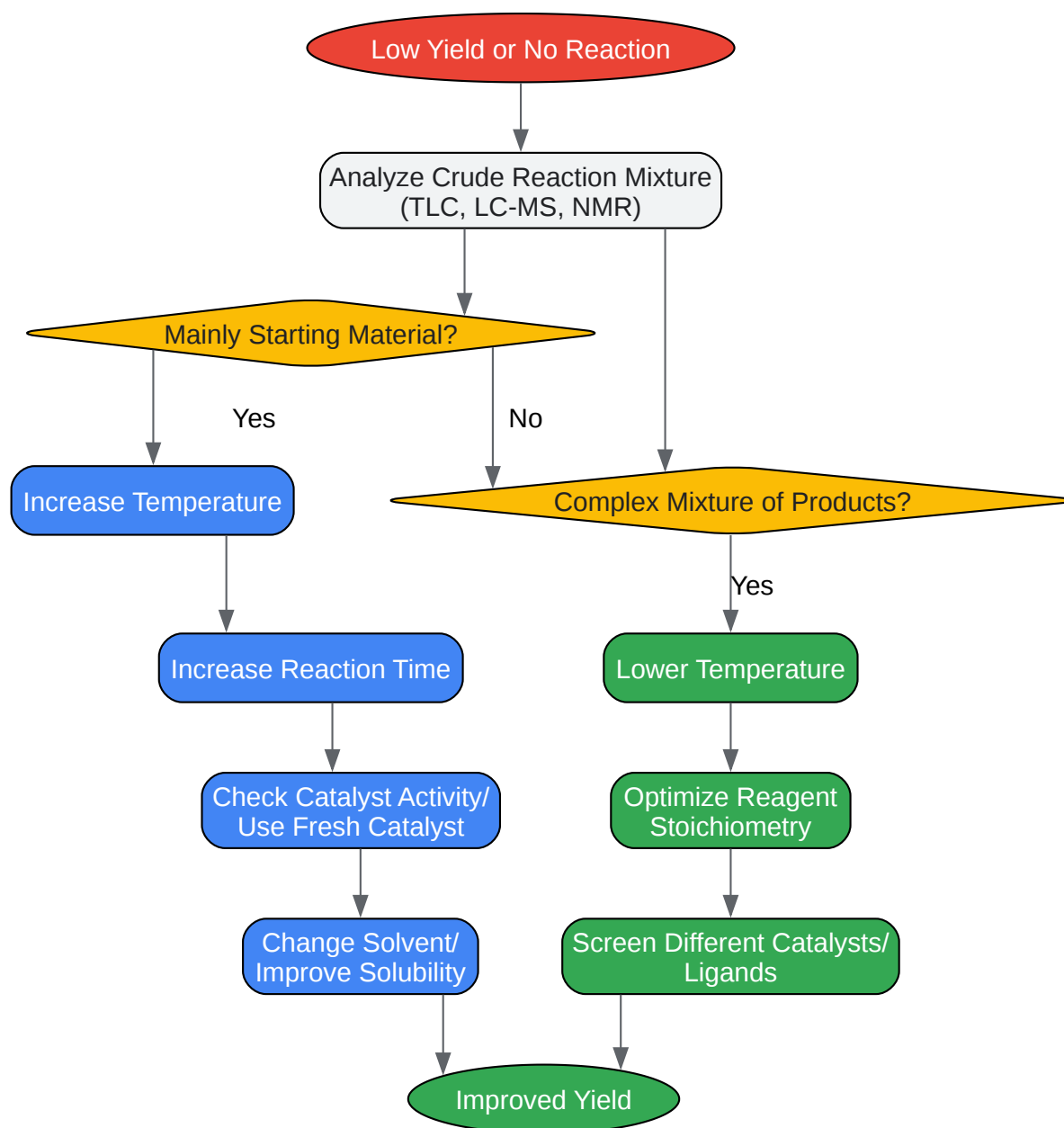
Diagram 1: Troubleshooting Workflow for Low Yield

Click to download full resolution via product page