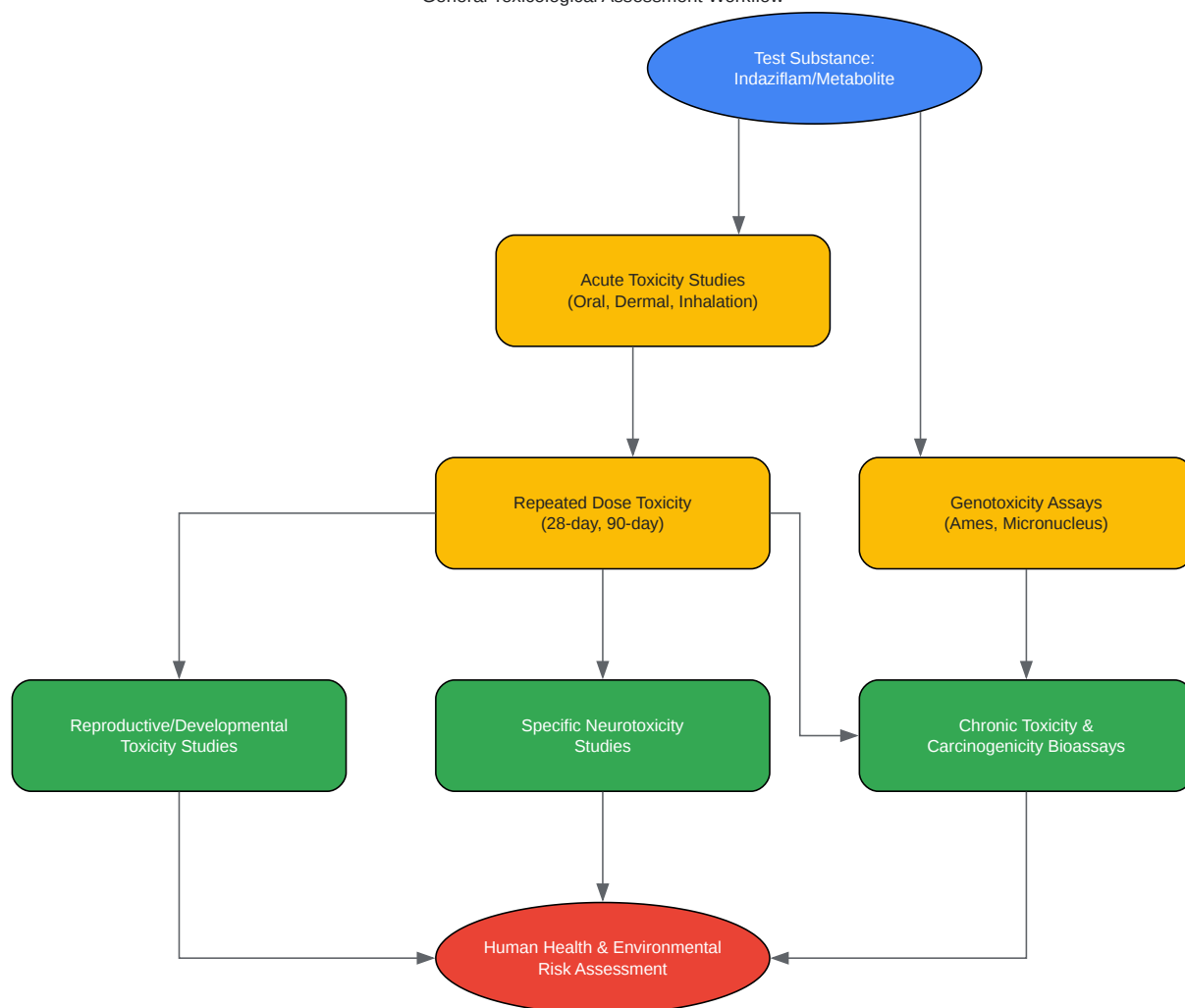
General Toxicological Assessment Workflow

Click to download full resolution via product page