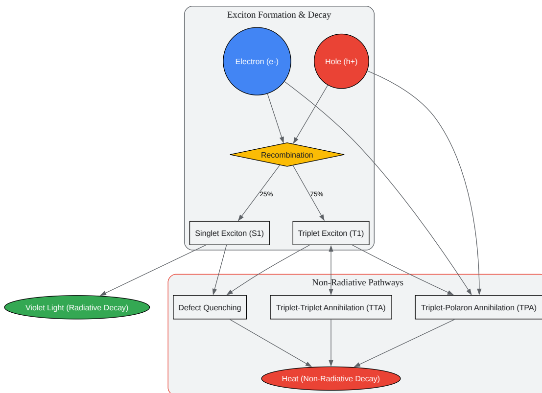
Figure 2: Key Non-Radiative Recombination Pathways in Violet OLEDs

Click to download full resolution via product page