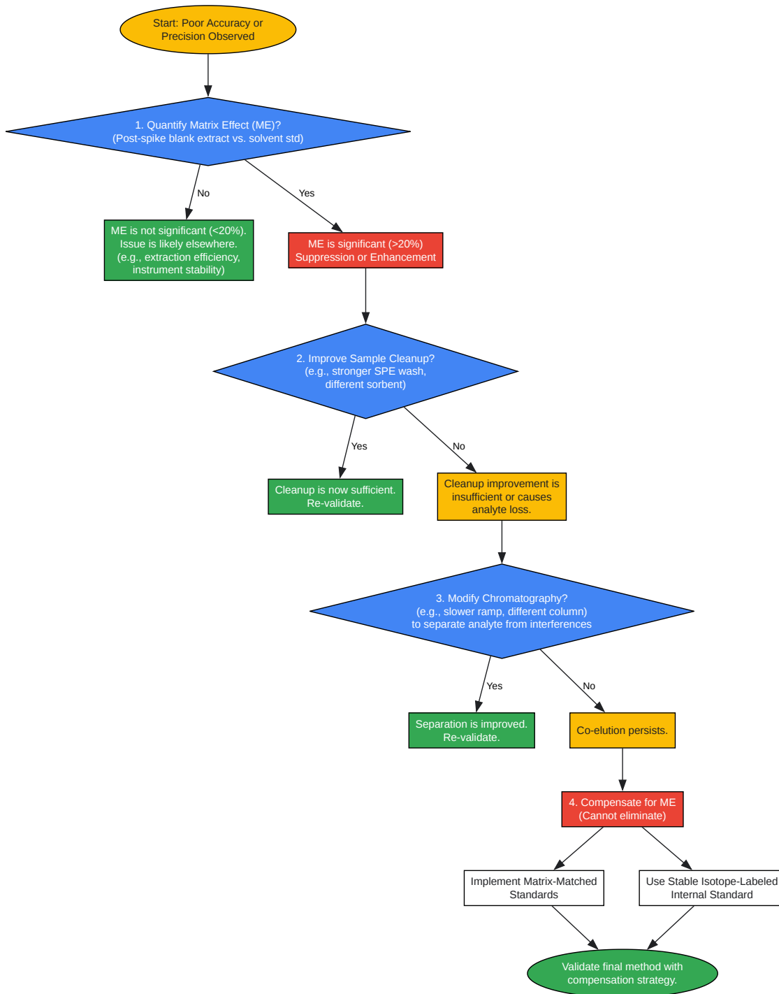
Figure 2: Troubleshooting Decision Tree for Matrix Effects

Click to download full resolution via product page