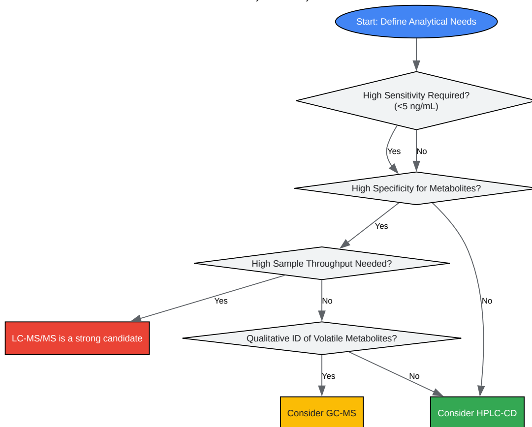
Decision Flowchart for Norcyclizine Analytical Method Selection

Click to download full resolution via product page