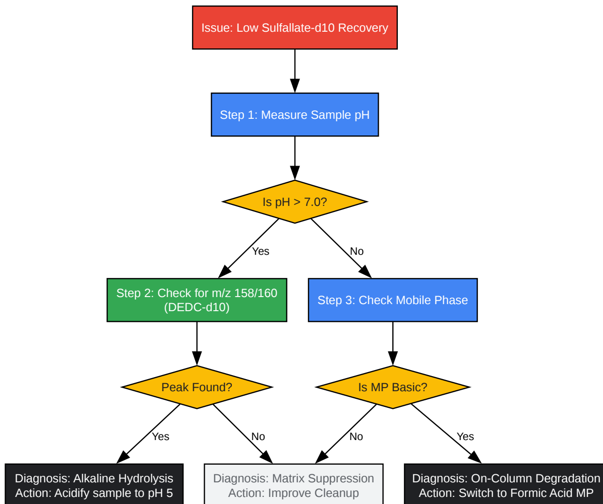
Figure 2: Diagnostic workflow for identifying Sulfallate-d10 instability.

Click to download full resolution via product page