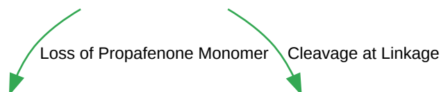
Figure 2: Hypothetical MS/MS Fragmentation of a Propafenone Dimer

Click to download full resolution via product page