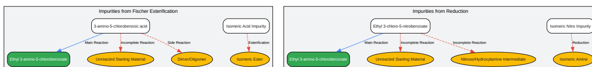
Caption: Overview of the two primary synthetic routes to Ethyl 3-amino-5-chlorobenzoate .

Click to download full resolution via product page