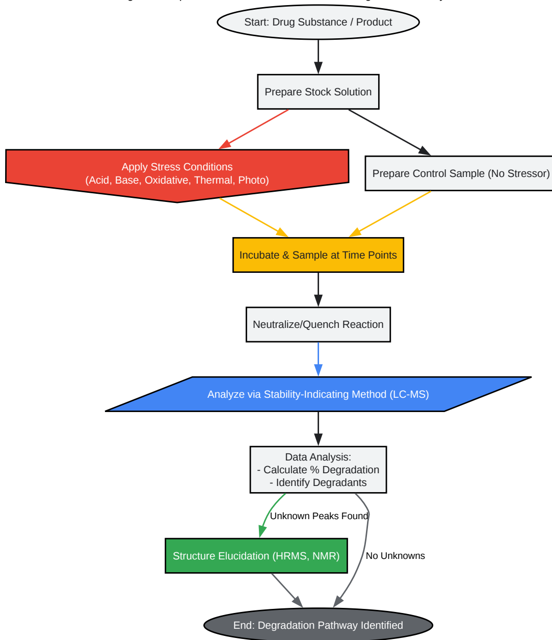
Figure 2. Experimental Workflow for a Forced Degradation Study

Click to download full resolution via product page