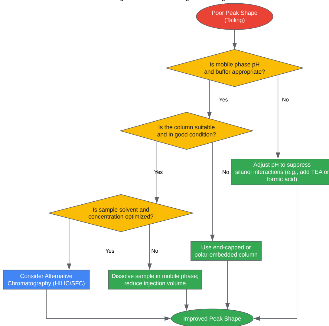
Diagram 2: Troubleshooting Peak Tailing

Click to download full resolution via product page