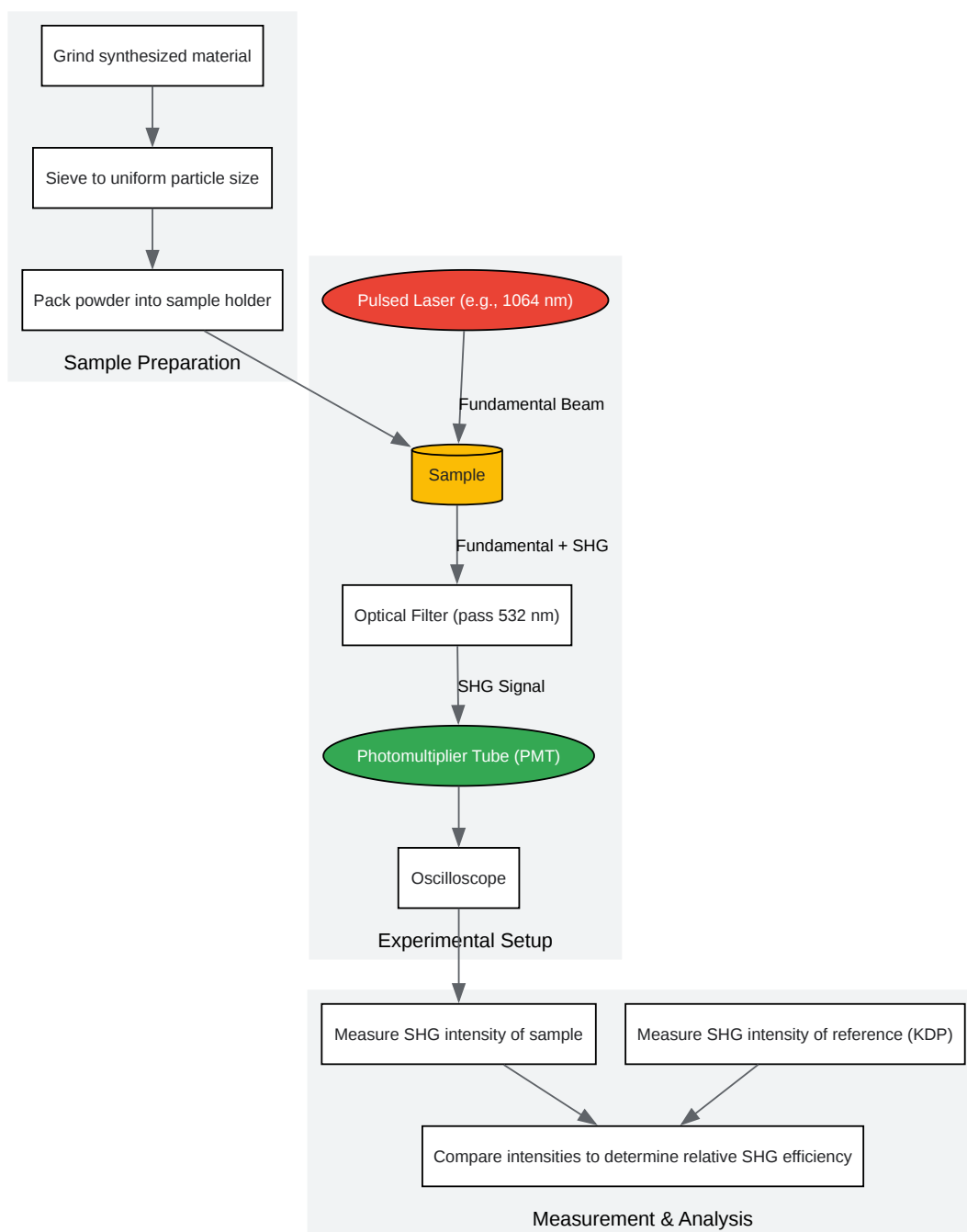
Figure 2: Experimental Workflow for Kurtz-Perry SHG Measurement

Click to download full resolution via product page