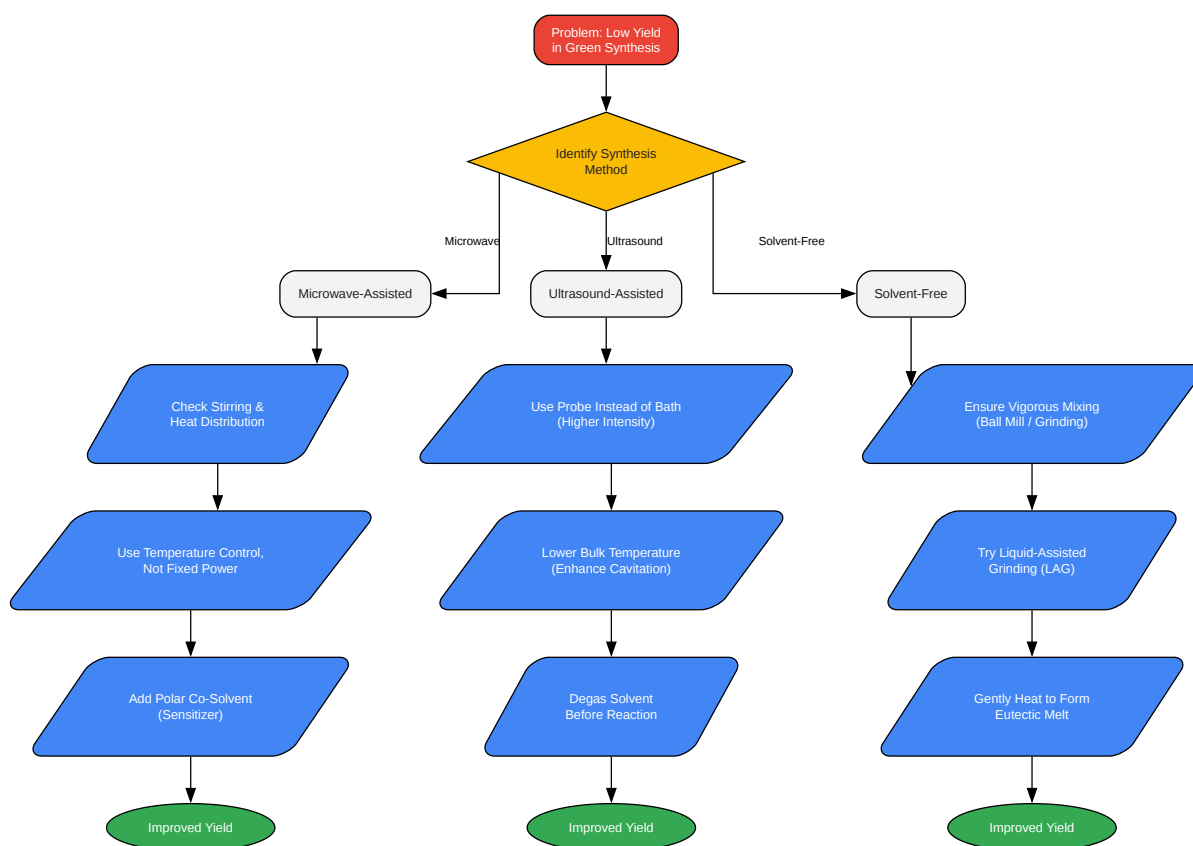
Diagram 1: Troubleshooting Workflow for Low Yields