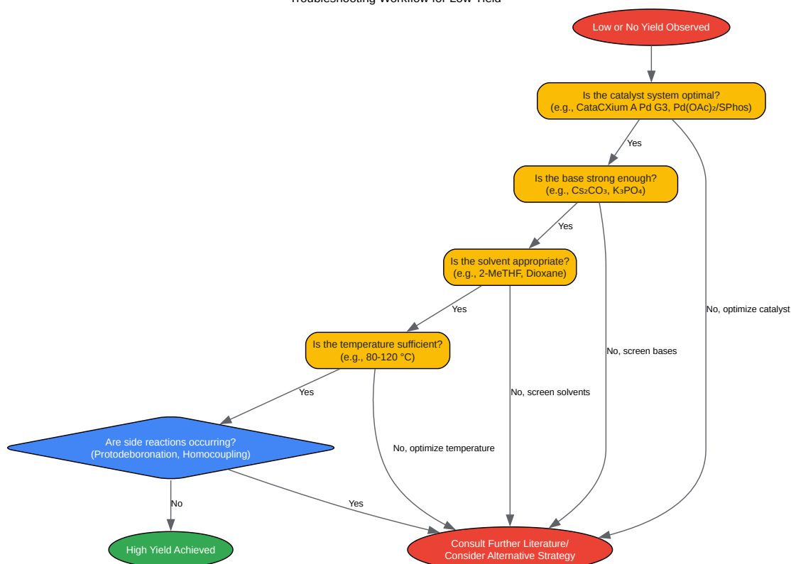
Troubleshooting Workflow for Low Yield

Click to download full resolution via product page