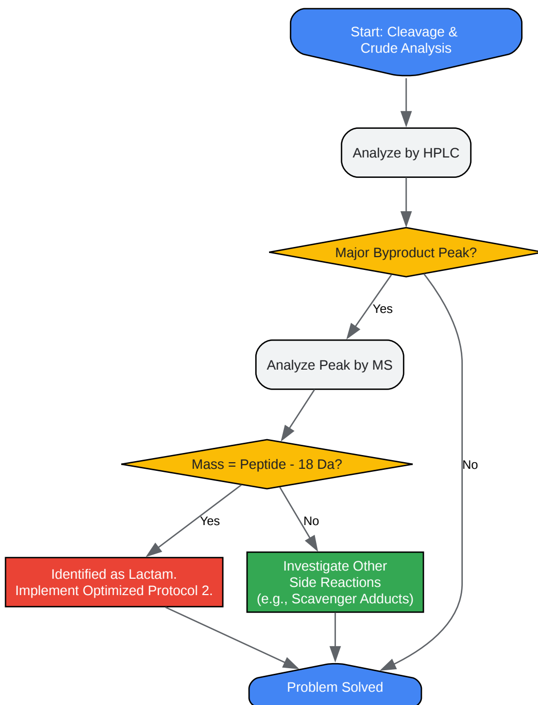
Troubleshooting Workflow for Ornithine Peptides

Click to download full resolution via product page