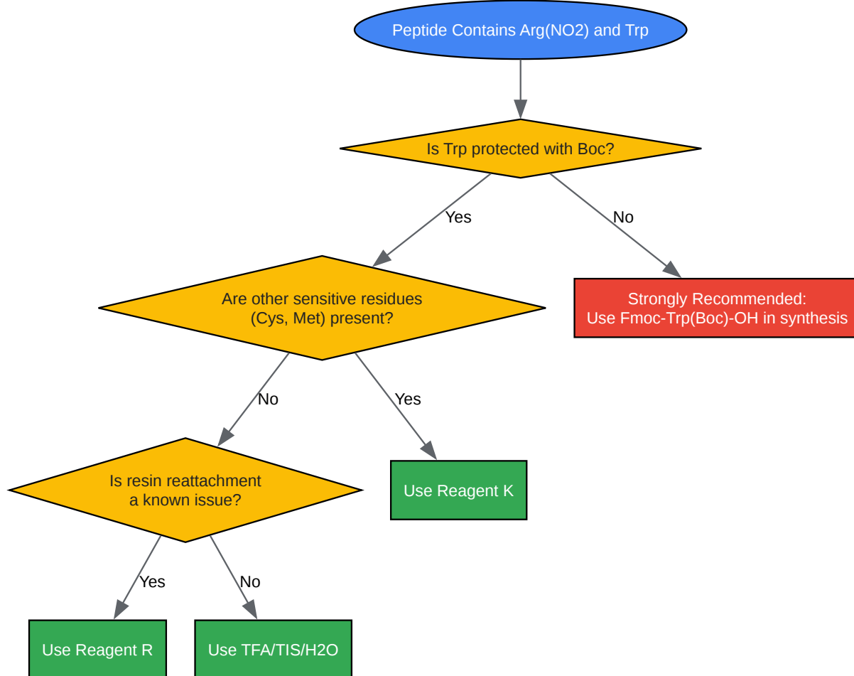
Fig 3. Decision Logic for Choosing a Cleavage Cocktail

Click to download full resolution via product page