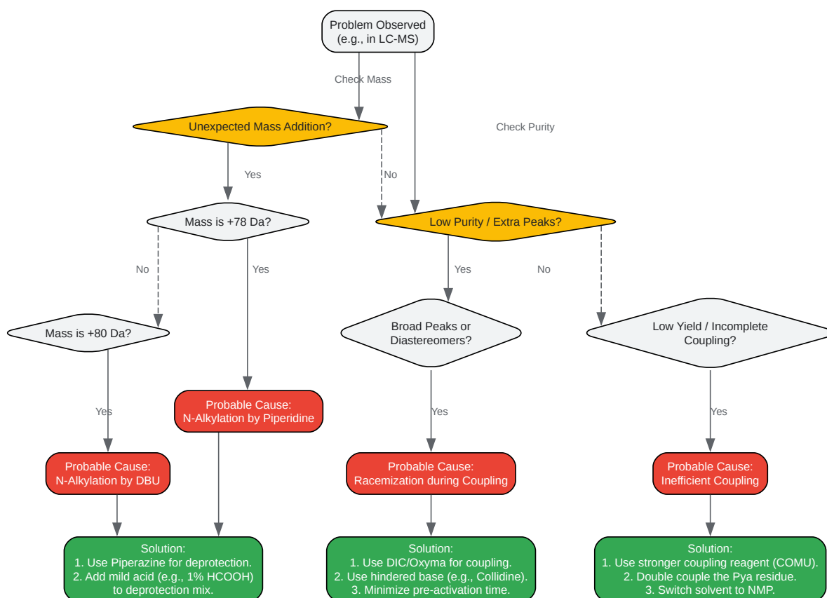
Diagram 1: Troubleshooting Pya Side Reactions

Click to download full resolution via product page