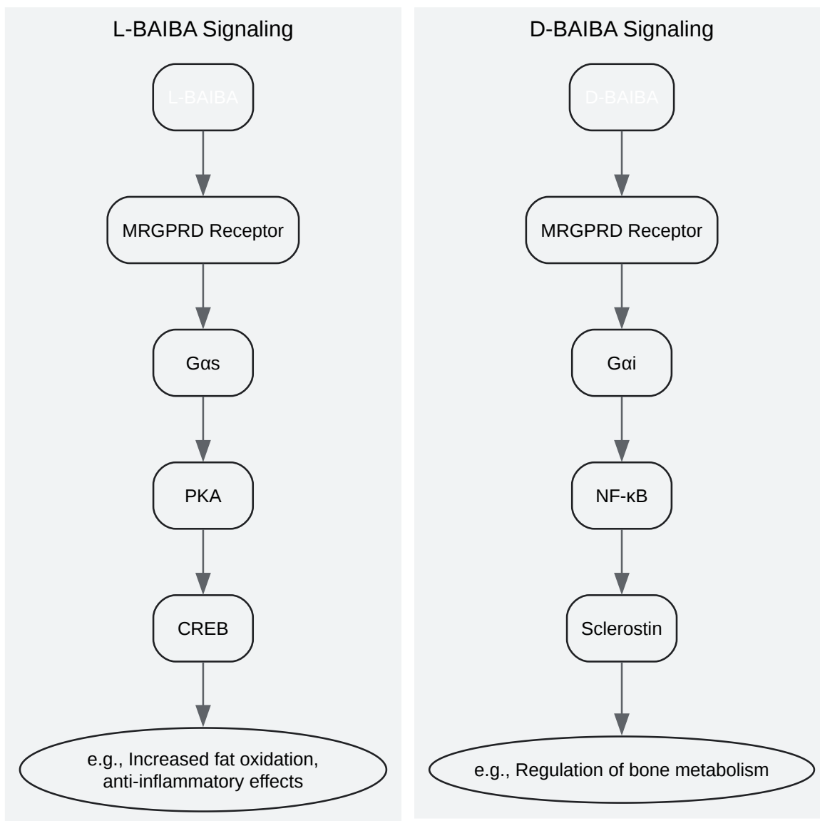
Figure 2. Distinct Signaling Pathways of L-BAIBA and D-BAIBA

Click to download full resolution via product page