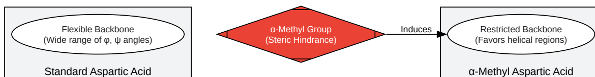
Figure 1: Conformational Restriction by \alpha -Methylation

The addition of a methyl group at the alpha-carbon sterically restricts the permissible dihedral angles of the peptide backbone, primarily the phi ( \phi ) and psi ( \psi ) angles. [3][4] This constraint dramatically reduces the conformational flexibility of the peptide chain, forcing it to favor specific, well-defined secondary structures. While \alpha -methylated residues are generally known as potent promoters of helical structures like the 3_{10} -helix and \alpha -helix, the precise conformational outcome is also influenced by the nature of the amino acid side chain. [1][5] This pre-organization into a defined structure can significantly reduce the entropic penalty associated with receptor binding, potentially leading to higher affinity. [1][3]