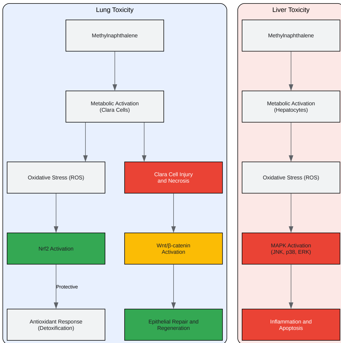
Key Signaling Pathways in Methylanthalene-Induced Organ Toxicity

Click to download full resolution via product page