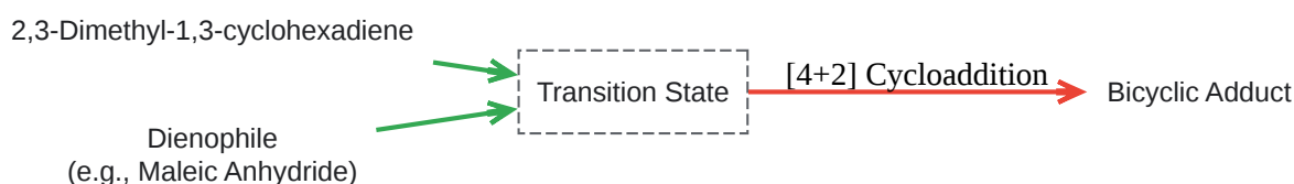
Figure 1: Concerted mechanism of the Diels-Alder reaction.

Click to download full resolution via product page