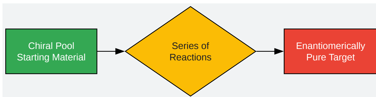
Caption: Workflow for Asymmetric Catalysis.

Click to download full resolution via product page