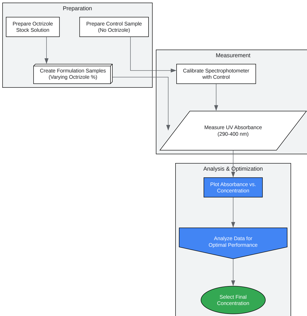
Experimental Workflow for Optimizing Octrizole Concentration

Click to download full resolution via product page