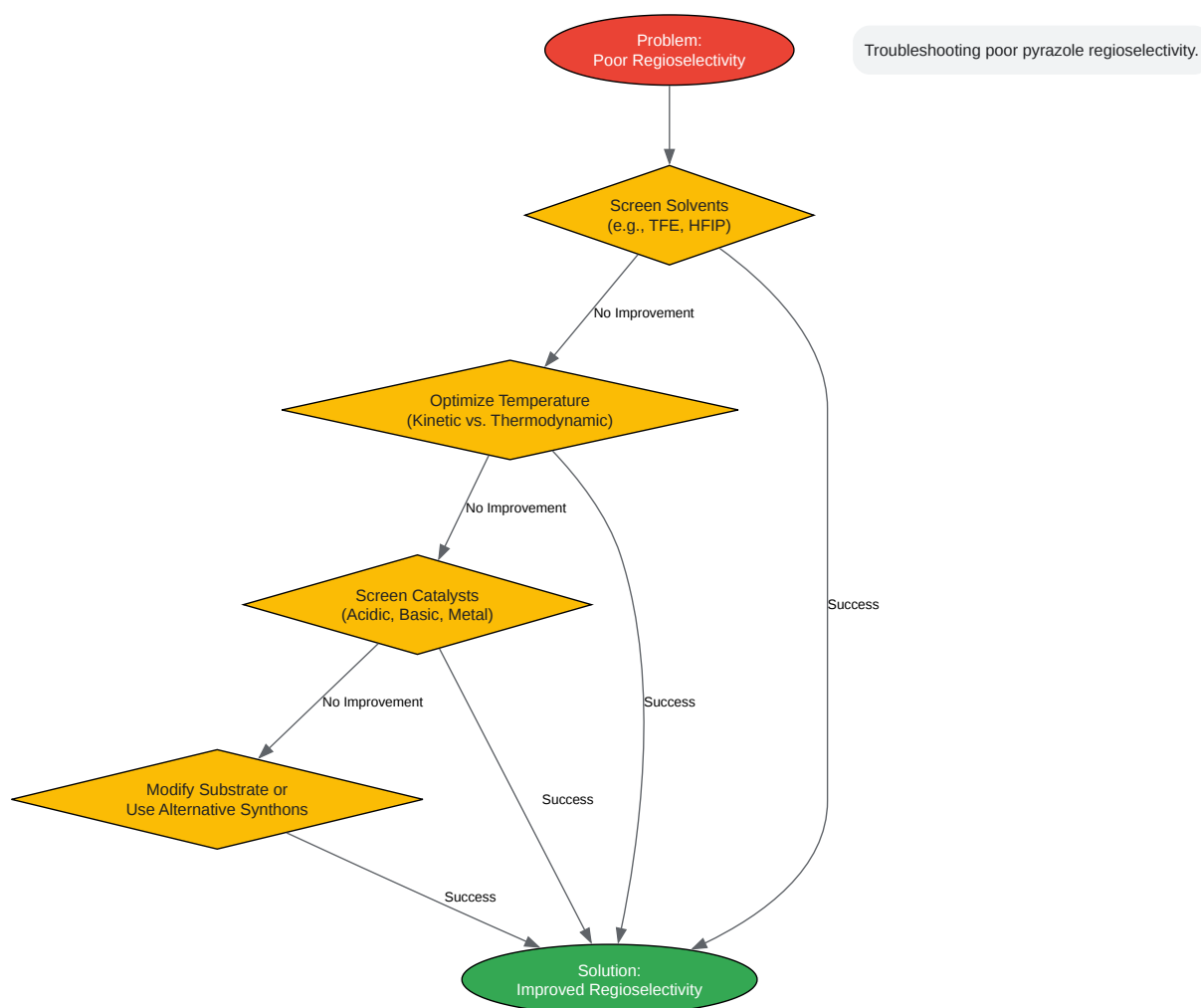
Diagram 2: Troubleshooting Workflow for Poor Regioselectivity