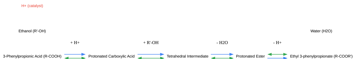
Diagram 1: Fischer Esterification Mechanism

Click to download full resolution via product page