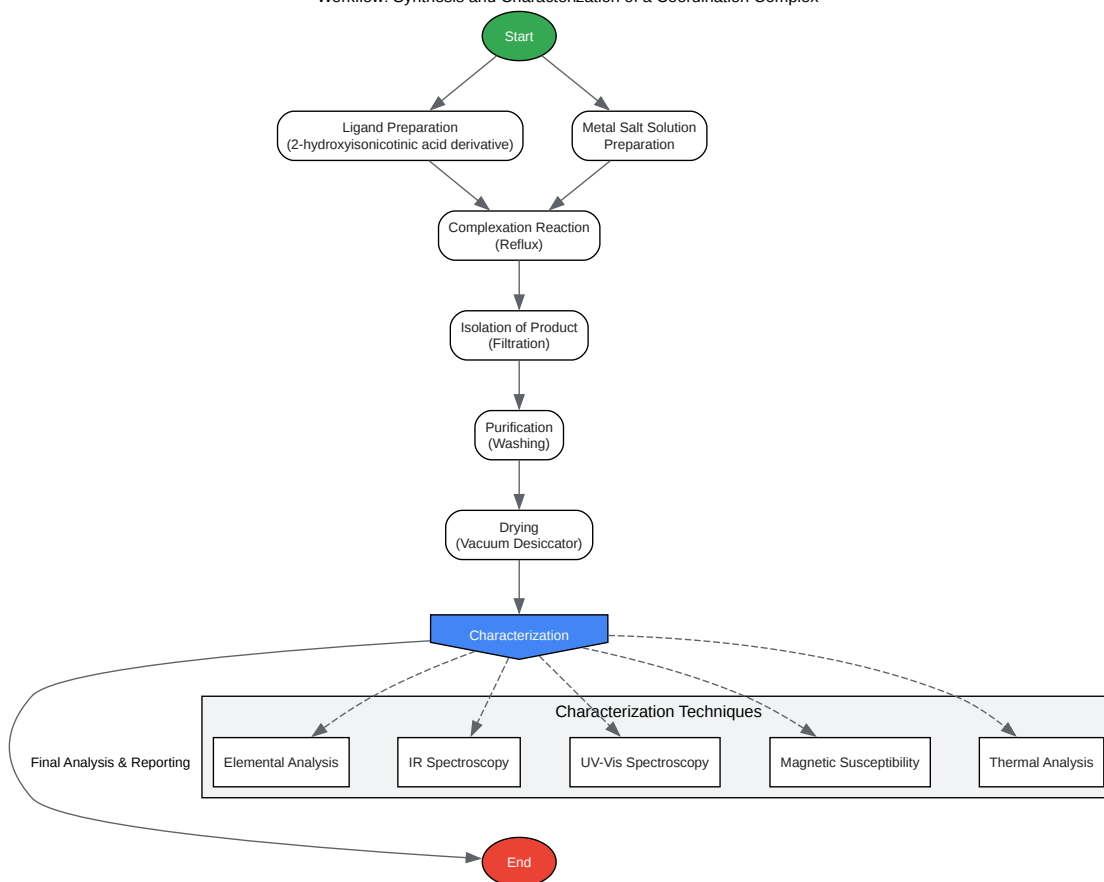
Workflow: Synthesis and Characterization of a Coordination Complex

Click to download full resolution via product page