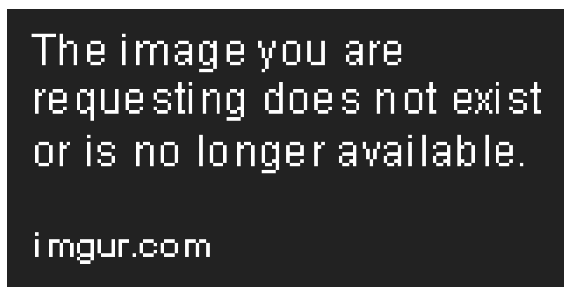
Figure 1: Structure and numbering of 1-phenethyl-1H-imidazole .

The following analysis is based on established chemical shift ranges for N-substituted imidazoles and phenethyl moieties.[3][4][5] The numbering scheme used for assignment is shown below: