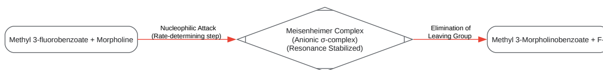
Diagram 2: SNAr Mechanism

Caption: The catalytic cycle for the Buchwald-Hartwig amination.