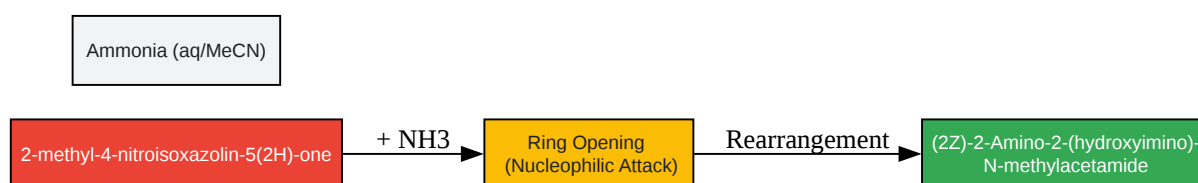
Figure 2: Synthetic Origin via Ammonolysis of Nitroisoxazolone

The compound is typically synthesized via the ammonolysis of a nitroisoxazolone precursor. Understanding this pathway aids in identifying impurities (e.g., residual starting material).