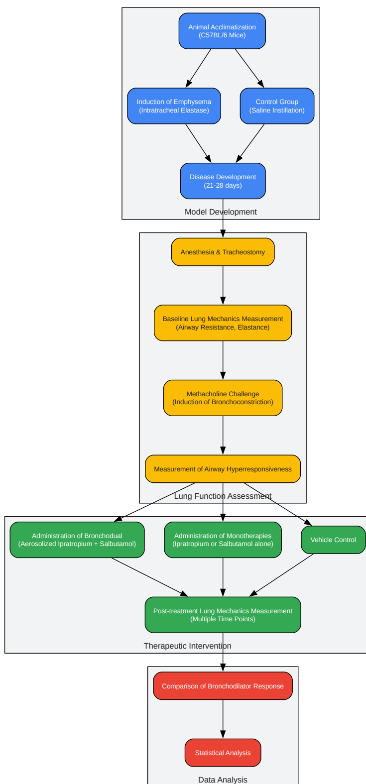
Figure 2: Experimental Workflow for Preclinical Evaluation

Click to download full resolution via product page