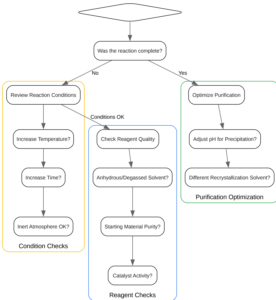
Figure 3: Troubleshooting Decision Tree

Click to download full resolution via product page